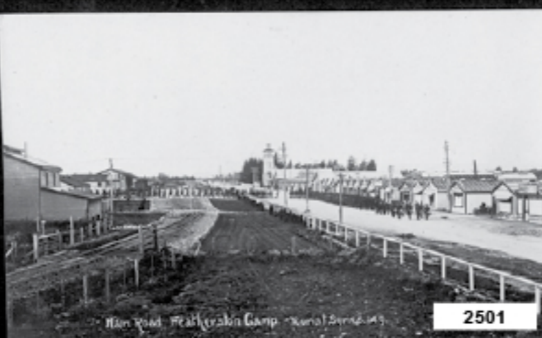
Man Road, Featherston Camp - Serial Series 149.