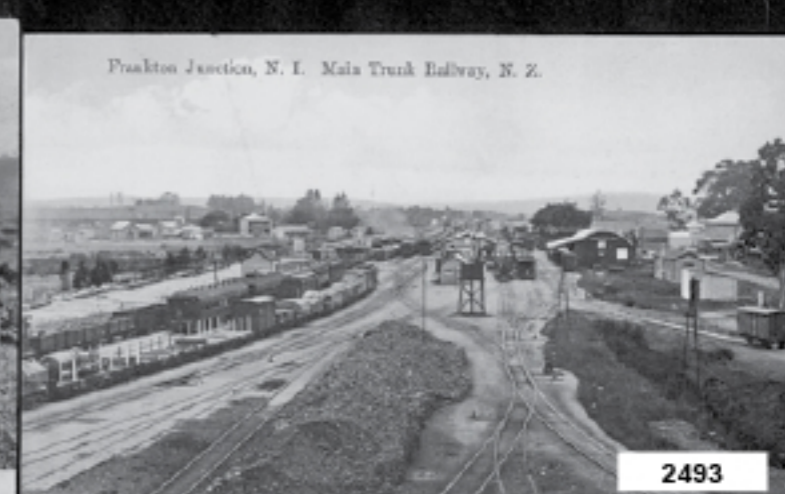
Frankton Junction, N. I. Main Trunk Railway, N. Z.