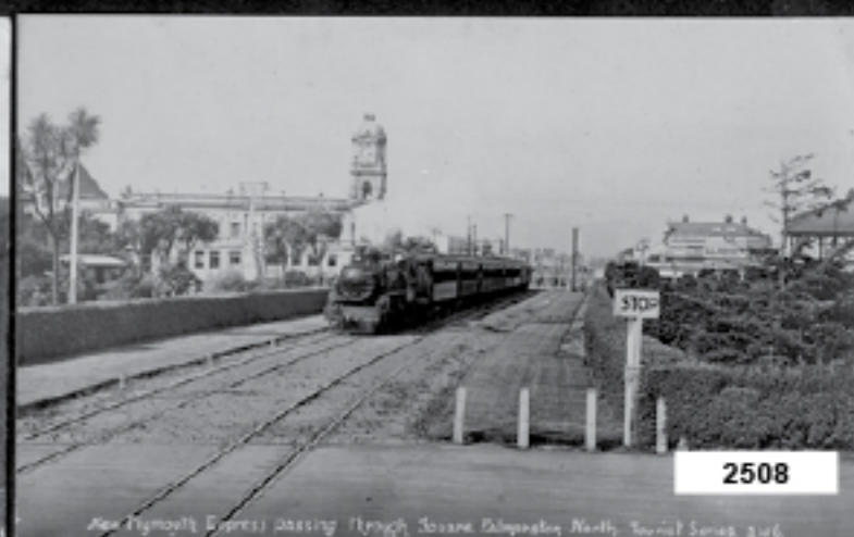
New Plymouth Express passing through Taranaki, North, Serial Series 149.