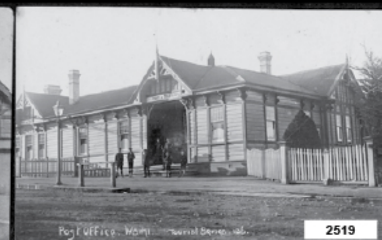
Post Office, Wanganui - Serial Series 149.