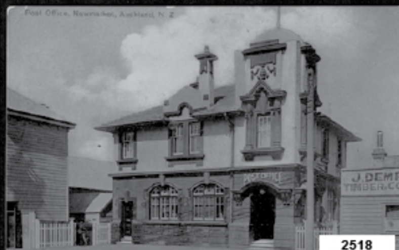
Post Office, Newmarket, Auckland, N.Z.