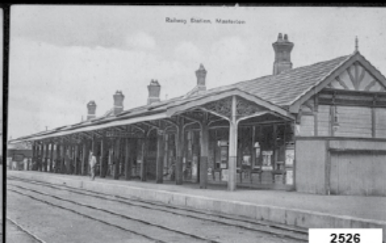
Railway Station, Masterton.