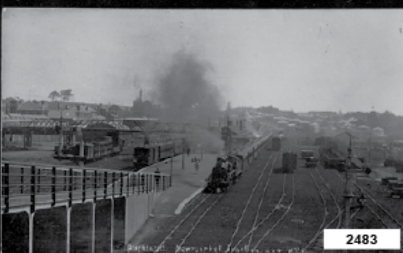
Bay of Islands, Newmarket, N.Z. - 2526.