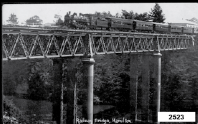
Railway Bridge, Hamilton.