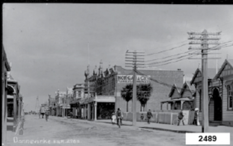
Dannevirke, N.Z. - 2765.