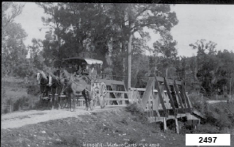
Horse-drawn Cart, near Wanganui.