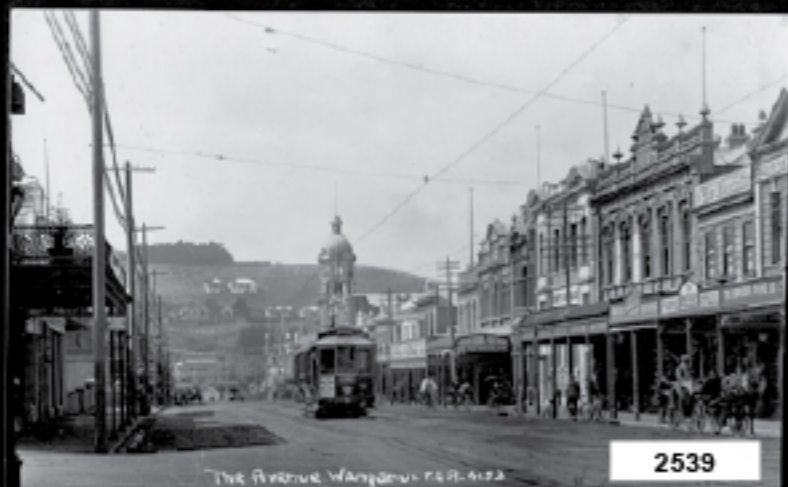
The Avenue, Wanganui - P. H. 6122.