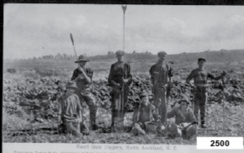
Four Men Digging, North Auckland, N.Z. 507/2526