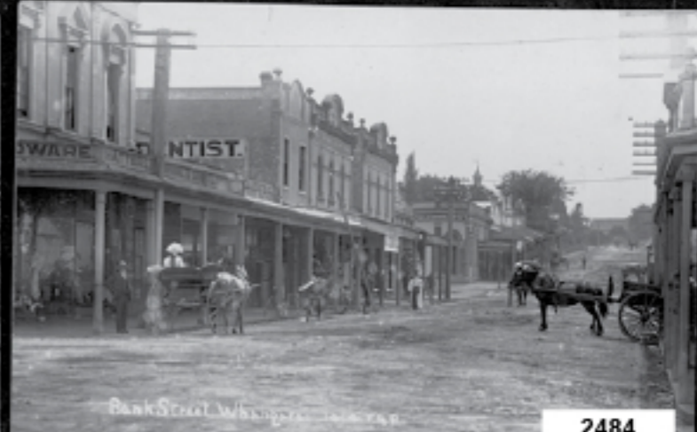
Bank Street, Wanganui - Serial Series 149.